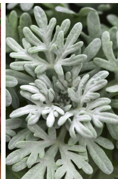
Artemisia Sea Salt (51)

For more fall promo boxes, visit www.carlinsales.com