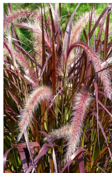
Pennisetum Rubrum (50)